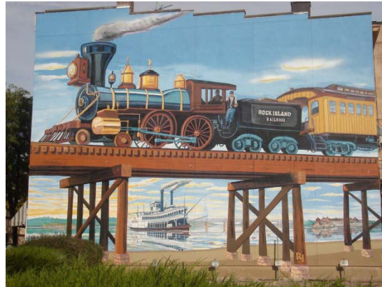
Rock Island Railroad, 1856 by William Gustafson

William Gustafson is an accomplished artist, graphic designer, and teacher who has painted several murals in the Quad City area. Recent works include two murals in downtown Rock Island: an original mural commemorating the 150 th anniversary of the first Rock Island Railroad train to cross the Mississippi River, and a restoration of the magnificent Black Hawk mural. Gustafson's full portfolio can be seen at www.gustafsonart.com .